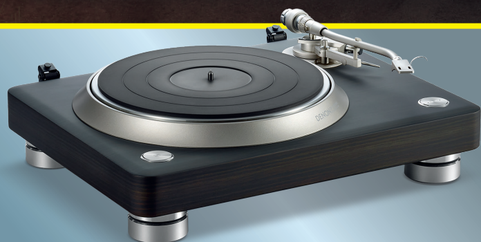
Rock-solid vinyl Denon's DP-3000NE direct-drive

Franco Serblin's Goldberg standmount stands out!