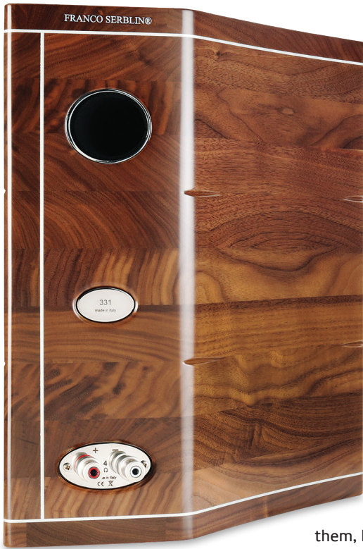
LEFT: The larger Goldberg cabinet houses a two-way crossover, WBT binding posts and large reflex port. Each handed pair is individually numbered

Throughout all my listening, there was a silkiness to the Accordo Goldberg's performance, a non-aggressive way with detail that had me scratching my head. How could there be this much detail without it sounding hyper-etched? The better tracks from the remastered 2023 edition of The Beatles' 'Red' collection, 1962-1966 [Apple 0602455920768] were even more revelatory than when I first played